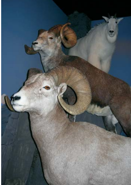
Wild sheep and goats, arranged according to the altitude of their natural habitats, greet guests on the lower level of the museum.

In June, the Oakes Museum will launch a summer program — the Curator’s Club —