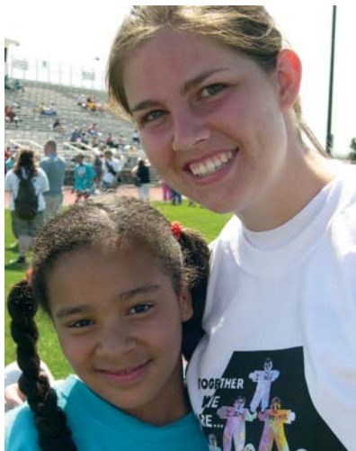
For 18 years, Messiah College students and staff have been assisting with Special Olympics by being “buddies” to the athletes.

This year’s Service Day and Special Olympics events will take place April 19. Special Olympics will be held at Messiah’s Starry Athletic Complex, and community members are welcome to attend and cheer for the athletes.