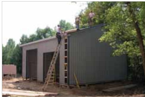
Construction of steel pole storage building behind Frey Hall.

Construction of a new steel pole building behind Frey Hall is nearly completed. This new storage facility will house larger projects such as the Light Sport Aircraft (LSA) and accommodate larger testing stations such as one for the Village Water Ozonization System (VWOS). Funding for this structure came through the Collaboratory from external sources, to compensate the College for space being used by the Biodiesel project. Since construction began in September 2009, the structure and electrical work has been completed. However, a biodiesel heating system is yet to be installed, and site work remains 80 percent complete until surrounding ground can be leveled later this spring. This new storage building frees up laboratory classroom space for the Department of Engineering while providing convenient access to project work from the laboratories.