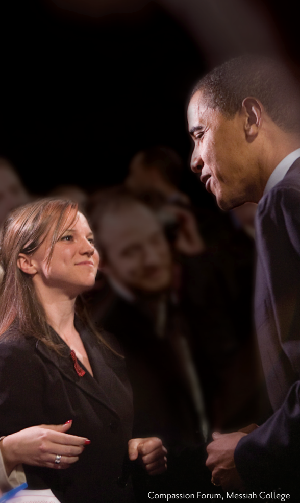
Compassion Forum, Messiah College