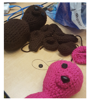
Top Left: Students assembling gift boxes; bottom left: volunteers with completed boxes for Operation Christmas Child. Top Right: Sarah Berger (FCS '17) knitting a teddy bear; bottom right: assembling a teddy bear.