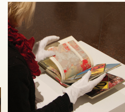
"DRAWING THE LINE: ARTISTS' BOOKS EXHIBITION" Oct. 28-Dec. 1, 2016