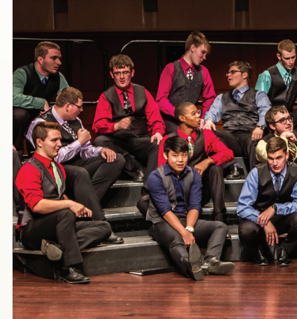
MESSIAH COLLEGE CHORAL ENSEMBLES April 26, 2017