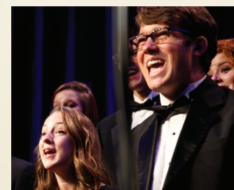
MESSIAH COLLEGE CHRISTMAS CONCERT Dec. 4, 2016