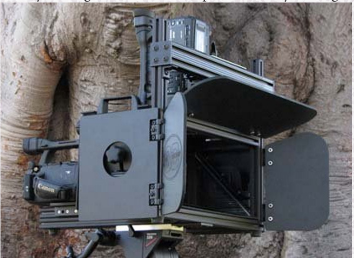
Continued on Page 8

Not to be out-done, last J-term I shot an experimental 3D video in our media production studio. It used a simple side-by-side rig like the one in the photo. Side-by-side rigs