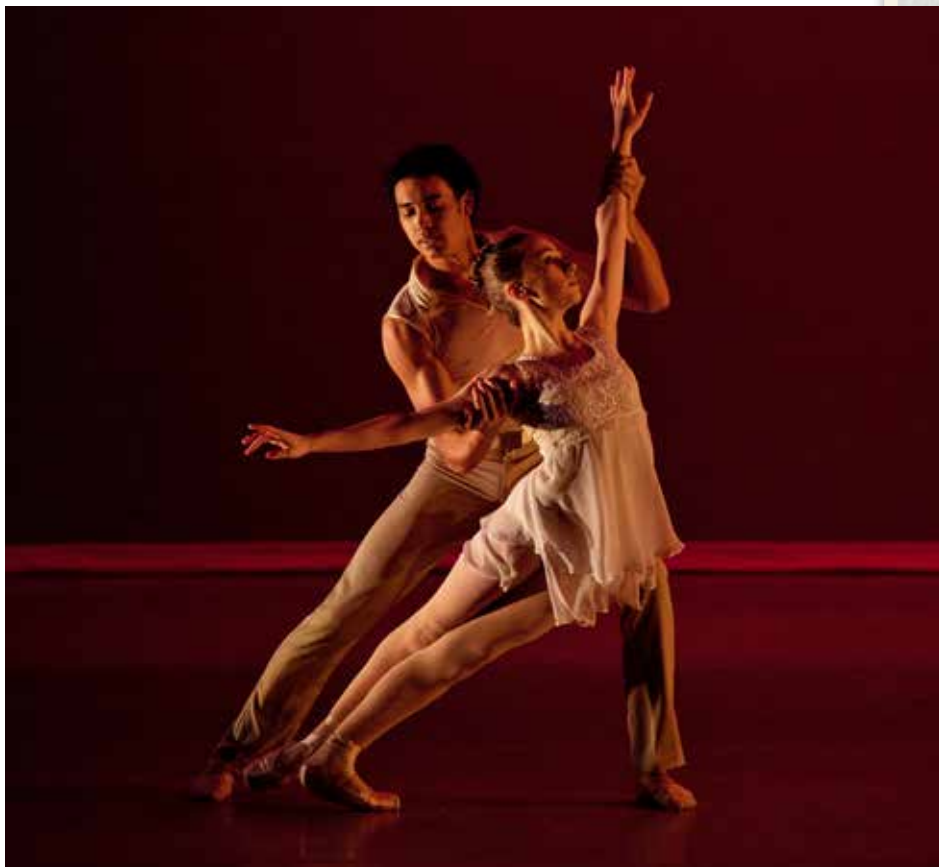
"To the Eternity" – choreography by Alan Himeline