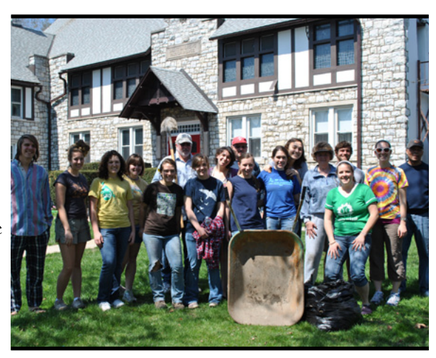
Students cultivate the garden at the Sycamore House in Harrisburg during a service plunge day.

through the Agapé Center. Additionally, Cooperative Institutional Research Program survey data from 2009 indicates that Messiah College students are significantly more likely to participate in volunteer or community service work than our comparison institutions. Looking ahead, the Messiah College Strategic Plan includes the goal of increasing student participation in experiential and service learning. Currently a comprehensive initiative is underway toidentify a service learning course in every major and throughout General Education.