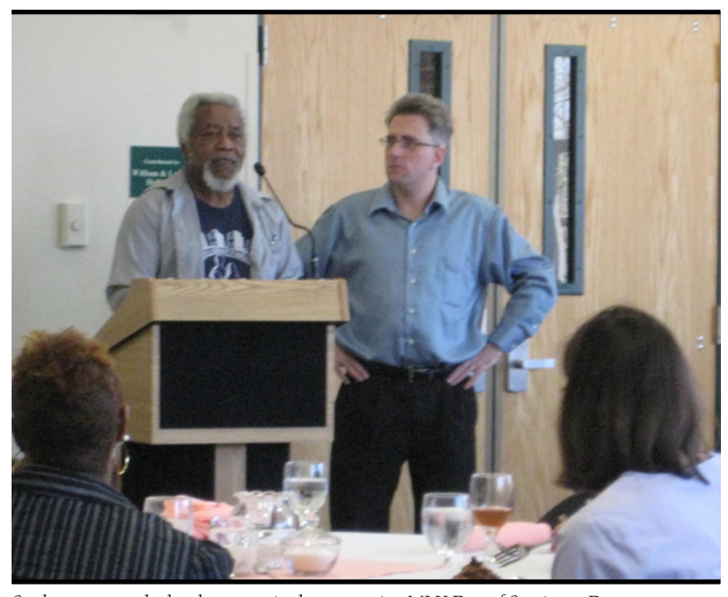
Students engage the local community by supporting MLK Day of Service at Danzante.

• messiah.edu/external programs/agape/local service/Housing.html