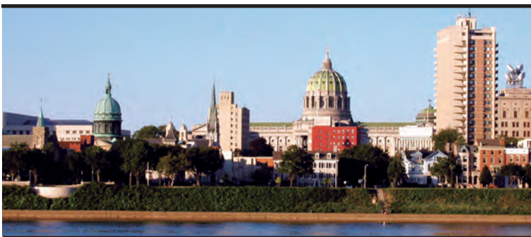
Dr. King Community Engagement Day included a cultural tour of Harrisburg.