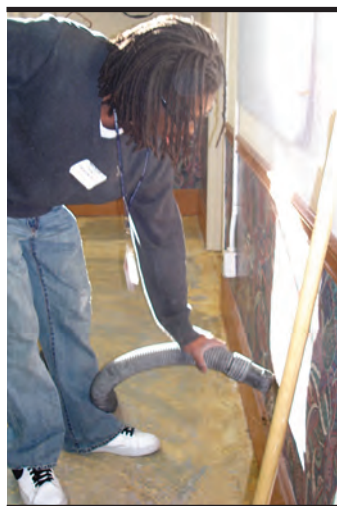
Into the Streets takes place during first-year orientation, introducing students to service opportunities at Messiah.