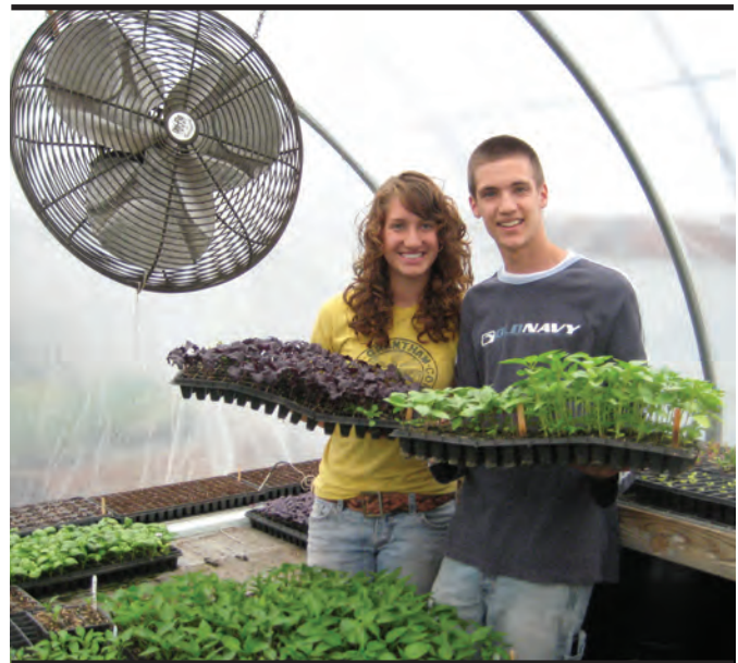
Messiah students volunteer with Joshua Farm through the Sustainable Agriculture Outreach Teams.

“It was challenging and also rewarding to hear their stories and understand that they are not some distant, different, “other,” but they are just like me, just as undeserving of God's love but just as blessed by it.”