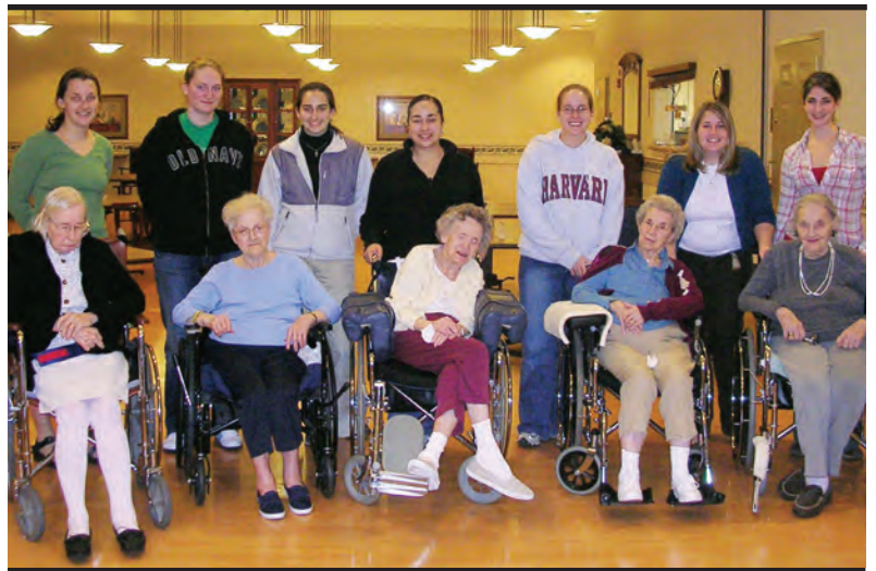
Messiah Outreach Teams visit residents of Bethany Village.