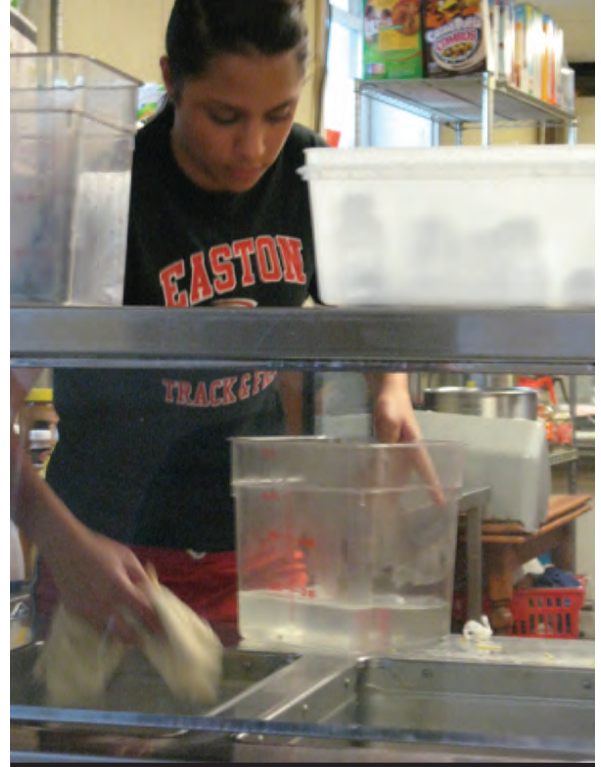
Students participated in a number of service projects with local community partners during Dr. King Community Engagement Day.

With help from the College Centennial Committee and a grant from PA Campus Compact this year, MLK Day activities began with a cultural tour of Harrisburg, followed by a discussion panel on the top of disability with community partners, and then a luncheon provided by Arepa City. The afternoon was spent participating in a number of service projects, such as helping patients who have multiple sclerosis with household tasks.