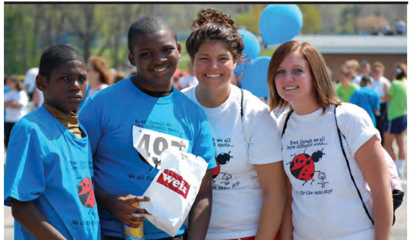
More than 3,000 individuals participated in Service Day on campus and throughout the region.