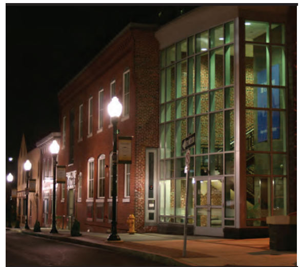
Harrisburg Institute is located on Dewberry Street in Harrisburg.