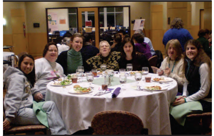
'Best Buddies' share a meal and Christmas carols on campus.

In addition to several chapels, several events were designed to bring volunteers and community members together to foster transformative relationships, such as: