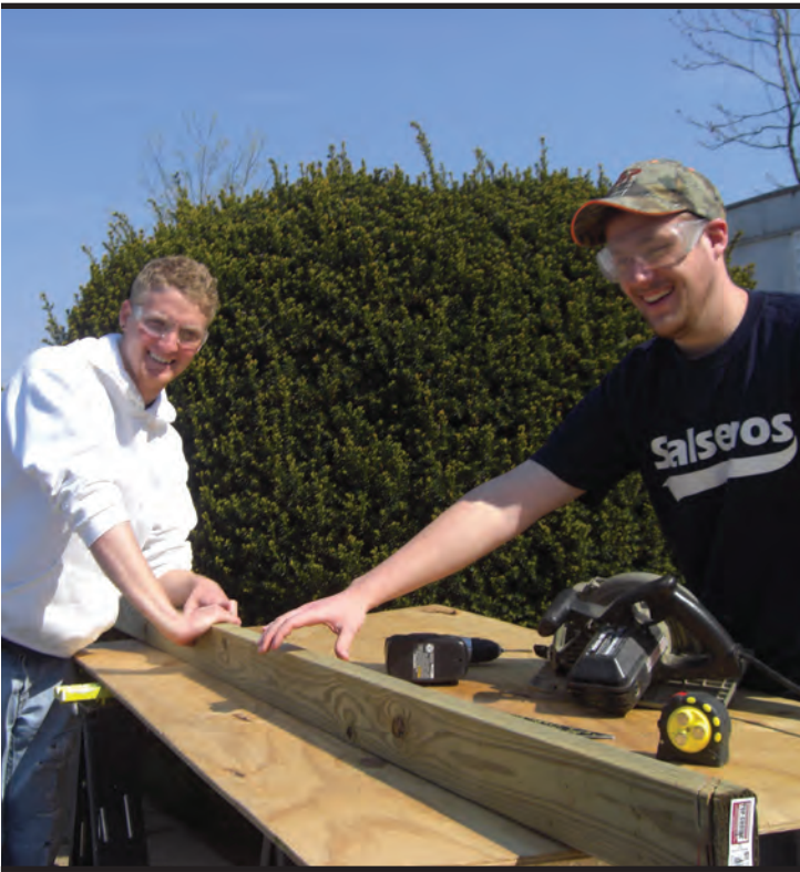
Each year, students participate in Service Plunge Days, which give them a one-day experience of stepping out into the community and serving.