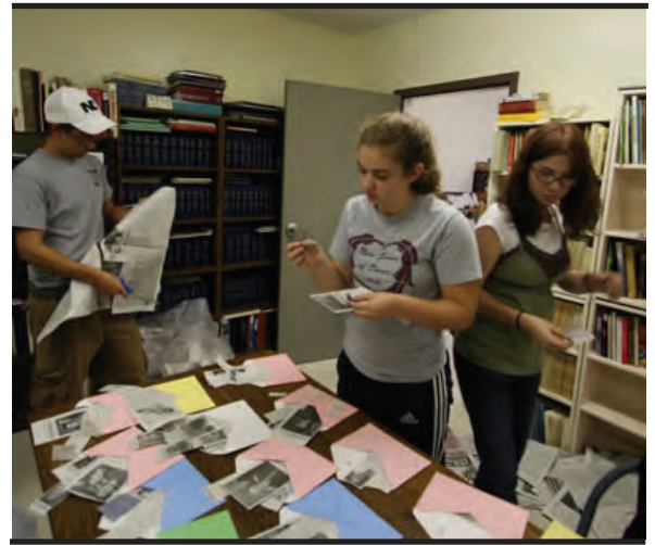
Many of the service opportunities for Service for Chapel Credit are organized through Outreach Teams.