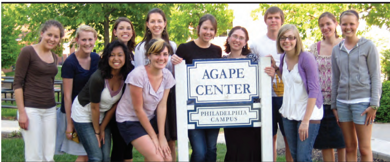
Student outreach coordinators work hard all year to connect teams of volunteers with different community partners in Harrisburg and the surrounding area.