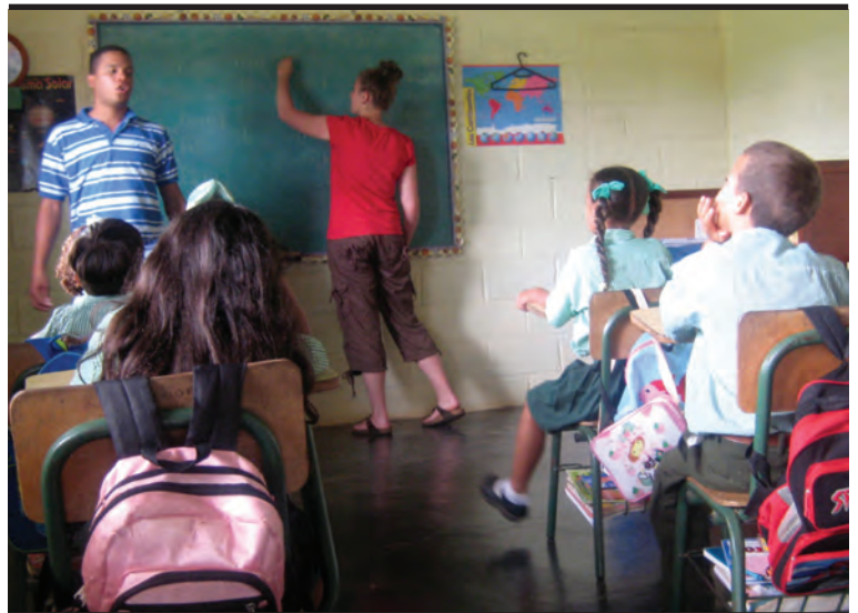
Service learning provides an opportunity for students to apply their skills.

This grant is designed to encourage faculty to integrate service learning into courses. Therefore, the grant can be used for faculty scholarship in the area of service learning, integration of service learning into existing coursework, transportation for service-learning opportunities or to assist in the creation of relevant service-learning programs or discussion groups.