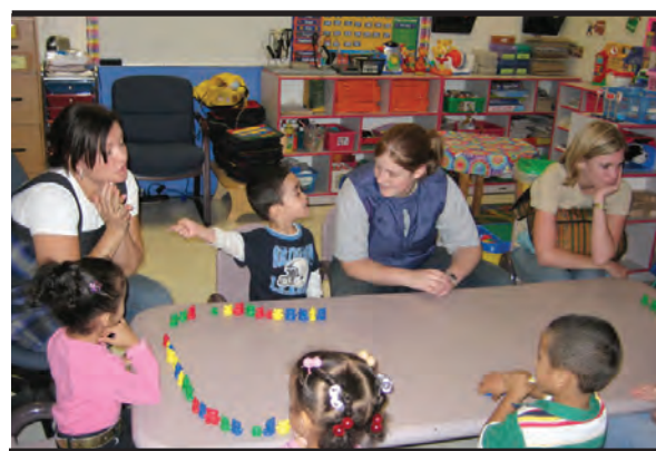
Students can engage in service-learning activities through opportunities provided by Outreach Teams.

“For almost any class or major, we could find a project that could meet their requirements while giving the students real-life experience in their community , while assisting us in our mission.”