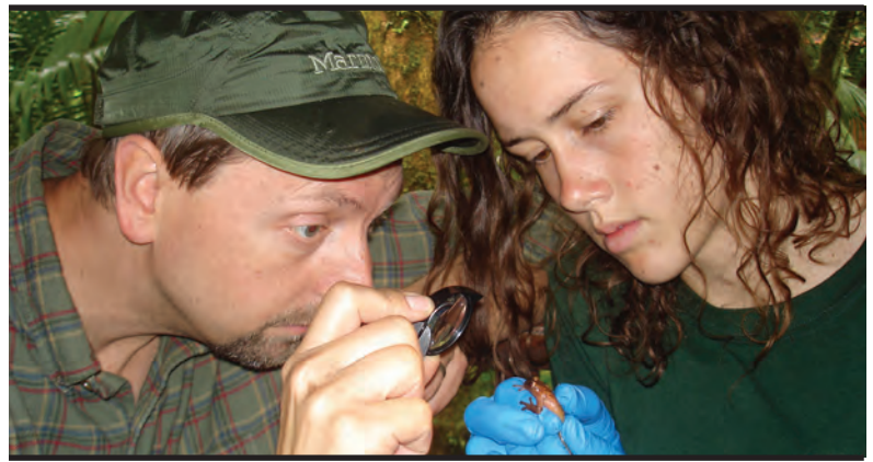
Faculty, staff and students take advantage of exploring the world around us in a multitude of ways.