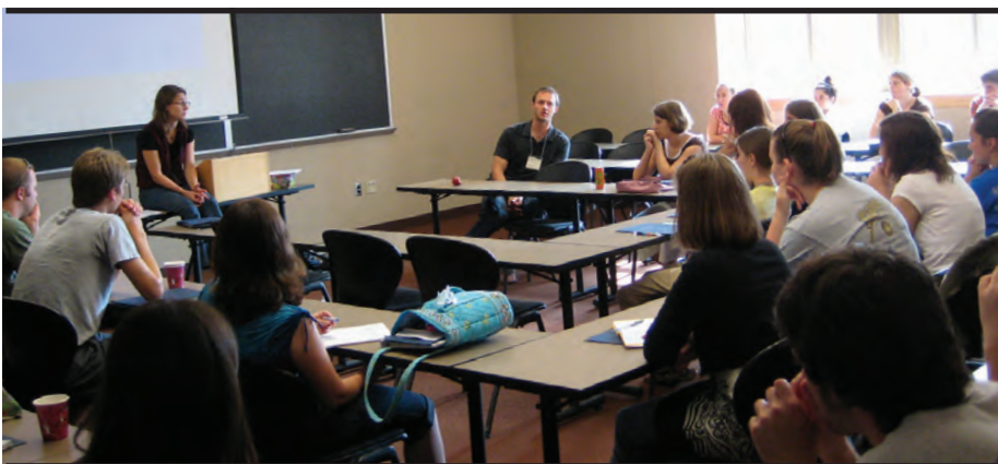
Service learning puts into action the concepts and ideas learned within the classroom.

“This [service-learning] requirement was my favorite thing about the classes because it allowed me to get out into the community to serve. ”