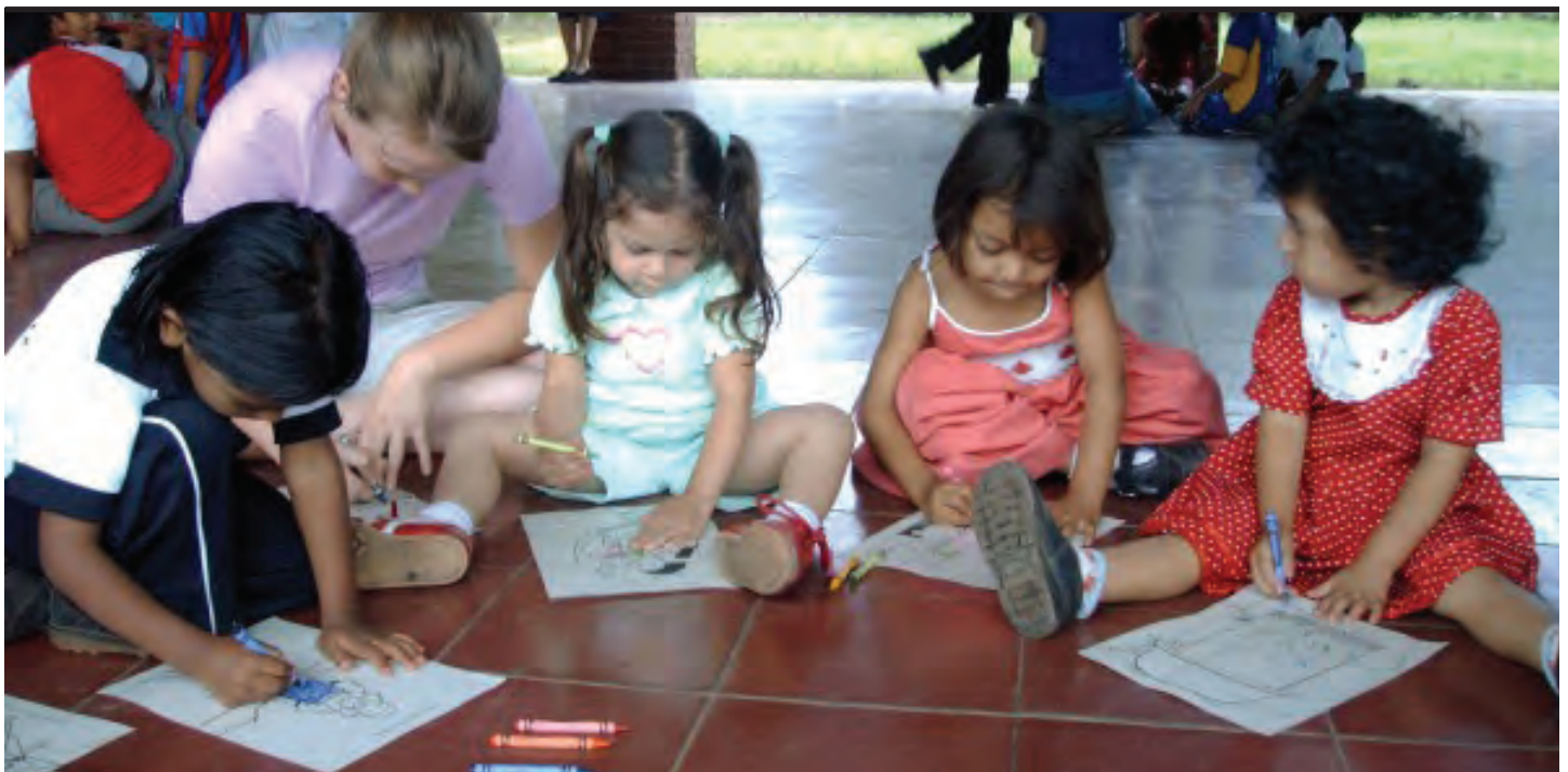
Relationship building is a key component of service learning.