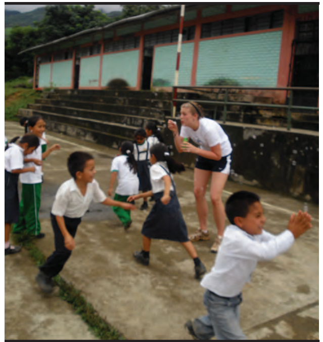
Relationship-building is a key component of service-learning.

“Not only is [service] a great way to bridge what you learn in the classroom with the outside world , but it helps you to be more aware of what you are seeing and experiencing during your time of service. It also forces you to get involved in the community when you otherwise might not even venture out, stopped by all kinds of excuses. After volunteering through service learning, I think that it would be hard to stop.”