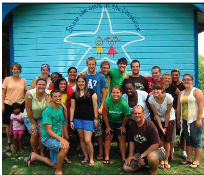
The summer service experience engages students in the culture and life of the community and provides them with unforgettable memories

“And what does the Lord require of you? To act justly and to love mercy and to walk humbly with your God.”