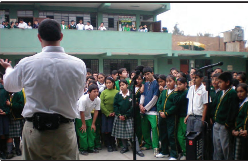
Faculty, staff and students have engaged in service learning throughout the United States and abroad.