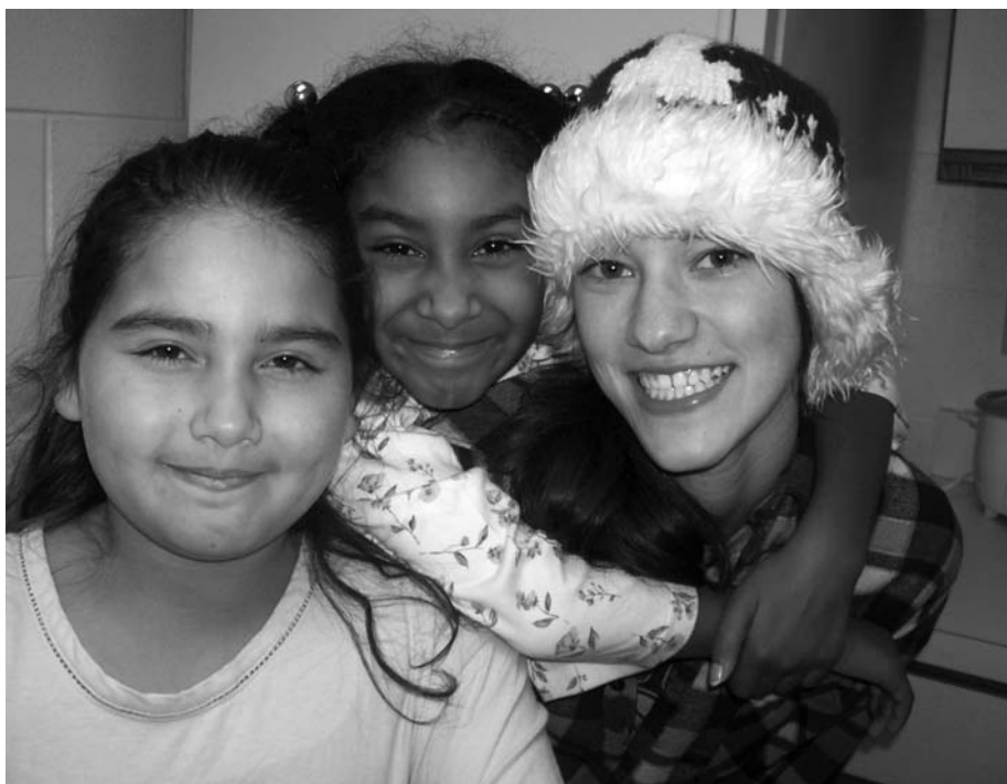
Volunteers build mentoring relationships with kids in after school programs in Harrisburg, Mechanicsburg, and Dillsburg.

The Agapé Center will host its fifth Biennial National Faith-Based Service-Learning Conference at Messiah College May 30–June 2, 2008. This conference is designed for both veteran and newcomer faculty who teach service-learning courses, directors of service-learning programs, student life staff working in service-learning, and community partners. Workshops and plenary sessions will again cover a wide spectrum of topics, including successful service-learning in various academic schools, building effective community partnerships, the role of service-learning in academics, and designing and sustaining a service-learning program.