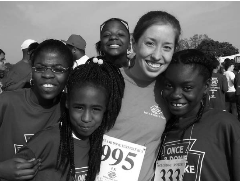
Students who engage the community through service often discover that they become the recipients of wonderful gifts.

Service-learning is a pedagogical model that intentionally integrates academic learning with community service in a credit-bearing academic course. Students participate in an authentic service activity that meets needs identified by the community partner (designed within the framework of a mutually beneficial relationship) and critically reflect on that activity. Thus, students gain a deeper understanding of course content and a commitment to socially responsible citizenship, and they develop skills and understanding needed to contribute to civic well-being.