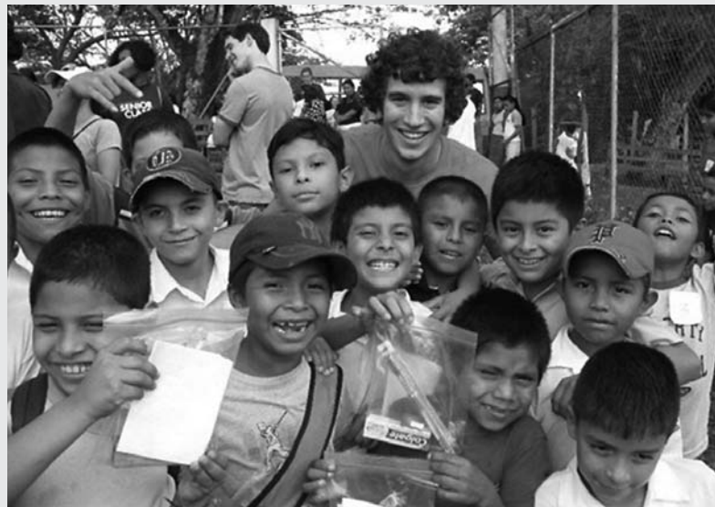
Service-Learning puts theory into practice for students locally, nationally, and internationally.