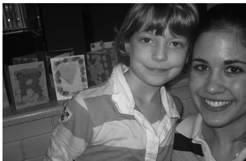
Philanthropy involves both monetary gifts and gifts of service. Through the Agapé Center grants program, students are able to give their summers to service in the church and society.

Frey Endowment Grant —This endowment provides roughly $12,500 annually. This is distributed to a small number of students to be applied to their fall tuition to make up for lost summer income. They must be on-site for at least eight weeks.