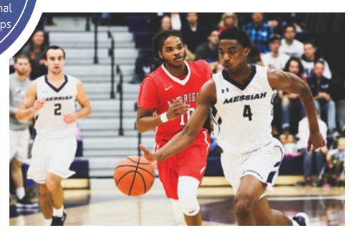
SOURCES: MESSIAH UNIVERSITY OFFICES OF ATHLETIC COMMUNICATIONS, INSTITUTIONAL RESEARCH AND MARKETING AND COMMUNICATIONS. FOR ADDITIONAL MESSIAH STATISTICS AND INFORMATION, VISIT MESSIAH.EDU/OFFICES/RESEARCH.