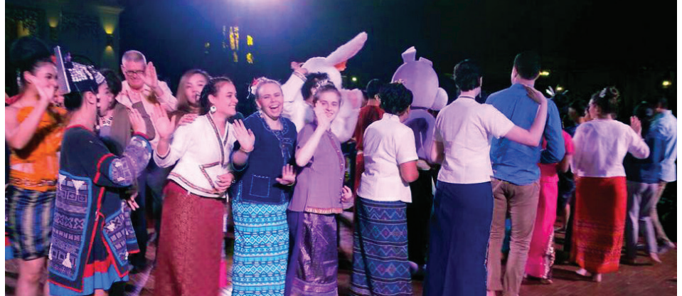
Messiah nursing students participating in a traditional Thai dance

Halfway through our trip, we were able to travel up to the mountainside of Chiang Rai and learn about what it is like to be in a village. We spent one day at a place called Doi Tung. Thirty years ago, Doi Tung did