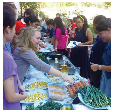
Messiah and Baromarajonanee College of Nursing students share a meal.

My Thailand Experience, continued on next page