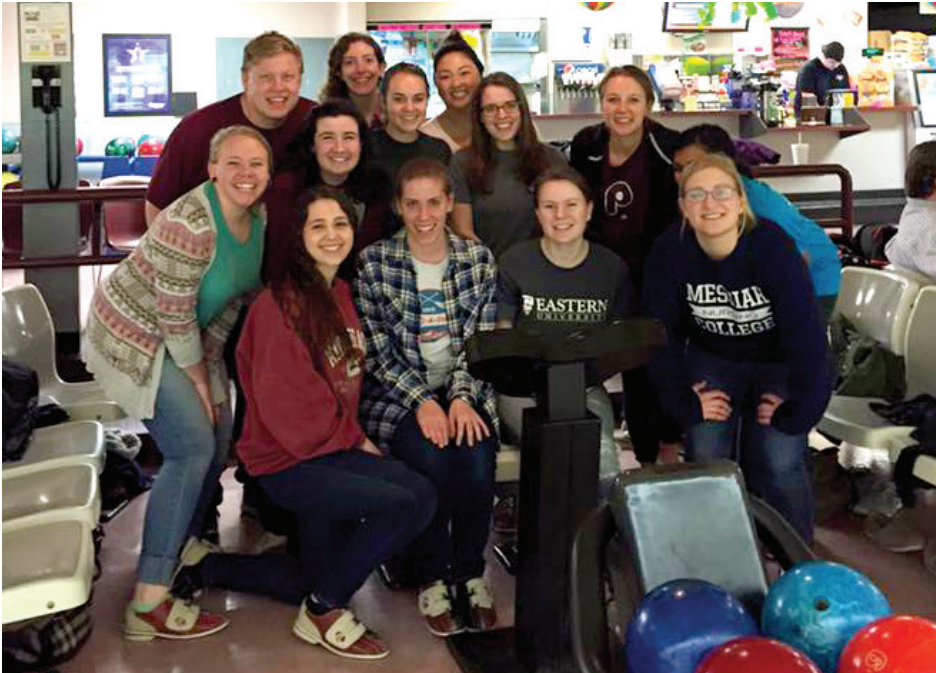
NCF members enjoy bowling together.