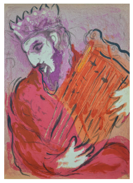
"David with Harp" Marc Chagall Lithograph, 1956