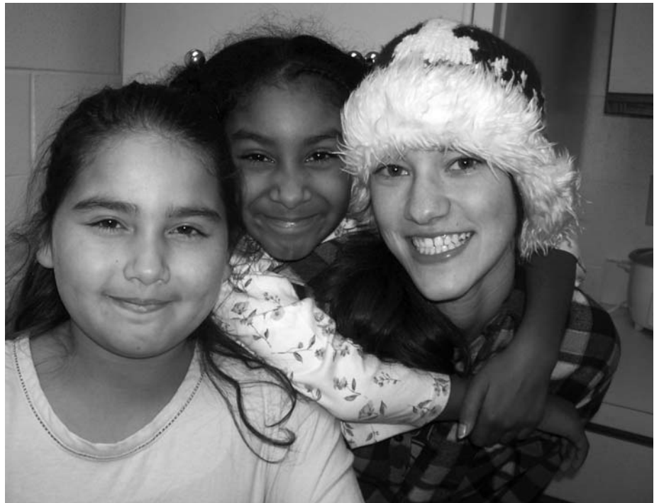
Volunteers build mentoring relationships with kids in after school programs in Harrisburg, Mechanicsburg, and Dillsburg.

The Agapé Center will host its fifth Biennial National Faith-Based Service-Learning Conference at Messiah College May 30–June 2, 2008. This conference is designed for both veteran and newcomer faculty who teach service-learning courses, directors of service-learning programs, student life staff working in service-learning, and community partners. Workshops and plenary sessions will again cover a wide spectrum of topics, including successful service-learning in various academic schools, building effective community partnerships, the role of service-learning in academics, and designing and sustaining a service-learning program.