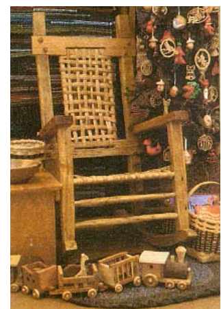
Examples of craft items from Red Bird's brochure.