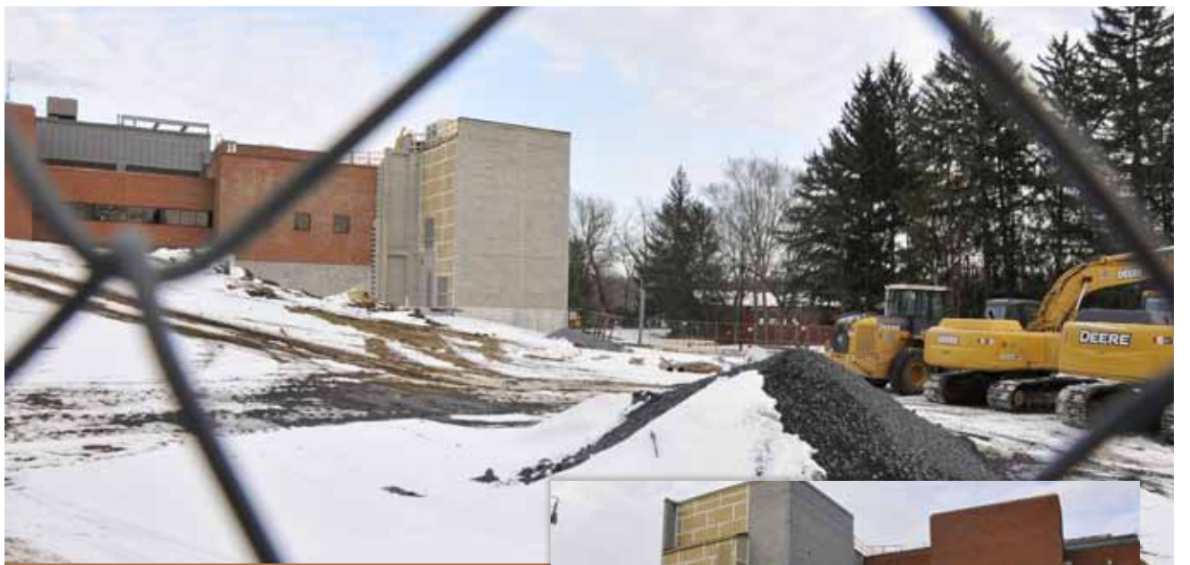
Current photos showing the construction site for the High Center, which is scheduled for completion in 2013.