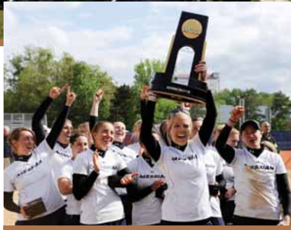
Softball athletes celebrate the team's first-ever NCAA Championship

Although Messiah can boast of NCAA championship wins in men's soccer (8 in the last 11 years), women's soccer and softball, and though other teams have competed in the NCAA championships, the heart of Messiah's athletic program