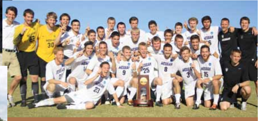
The men's soccer team has won the NCAA Championship eight times in the past 11 years!

"This is intercollegiate athletics—not intramurals. There is a scoreboard. We compete against other institutions; one team will leave the event with a win, and the other with a loss. Conference