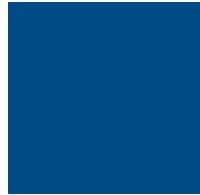
Messiah College Blue

If the application has color, all logo icons and type must appear in Messiah Blue. They can also be reversed out of Messiah College Blue or Black.