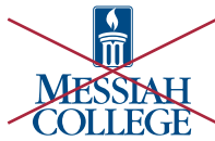
INCORRECT USAGE Shifting of elements