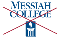
INCORRECT USAGE Shifting of elements