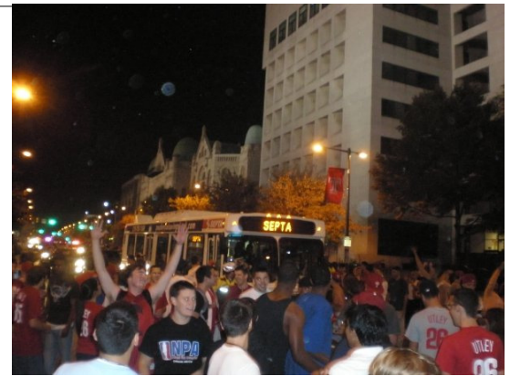
A SEPTA bus is stalled by a Phillies mob.

If you would like to see more photos added, please send your pictures to sb1338@messiah.edu