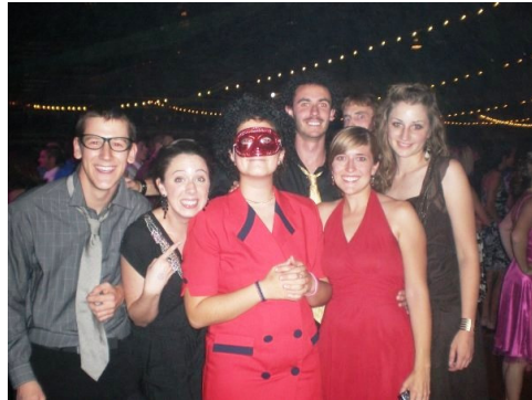
MCPC students at Messiah's 2008 Homecoming Dance.

on the dance floor. We danced, we laughed, we unconsciously formed MCPC dancing circles, we got dancing cramps, we perspired. We had fun. There are pictures on Facebook to prove it.